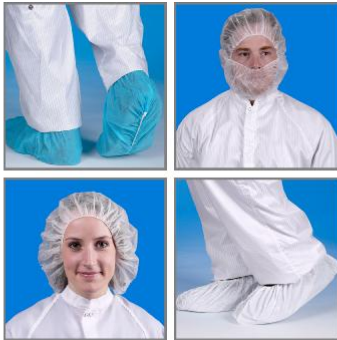
Typical Cleanroom Garments