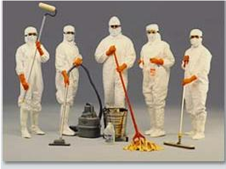
A properly attired and equipped cleanroom cleaning crew.